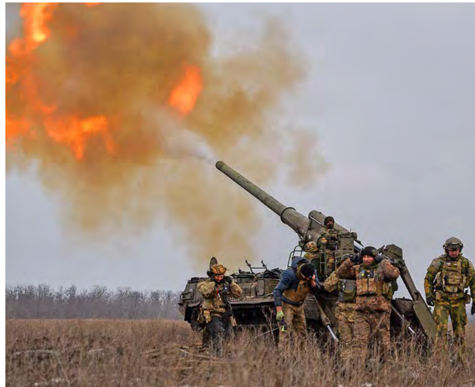
Ukrainian soldiers near Bakhmut, February 2023.

today. But I think what he hasn't grasped is the real nature of our position and what was really wrong with these articles back in 2014. It's a sentence he didn't quote that said, well, there's no revolutionary party in Ukraine and Russia, so no revolutionary perspective is possible [referring to "U.S. Imperialism Behind Bloody Repression in Ukraine", Workers Vanguard no 1046, 16 May 2014]. That's something you echoed in