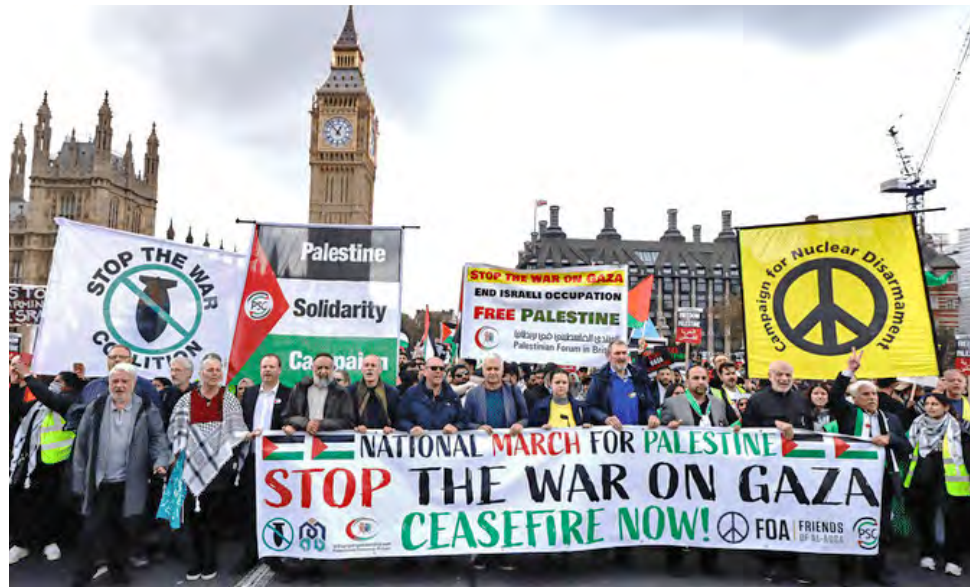
London, 28 October. Liberal politics dominating mass marches show no way to fight imperialism and liberate Palestine.

The organised working class is the only force that can really defeat the murderous policy of the imperialists and take a real step towards stopping the current massacre. Trade unions must take concrete action to stop arms shipments to Israel. Armaments